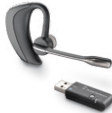
Plantronics Voyager PRO UC headset with Bluetooth USB dongle

For more information about Voyager PRO UC or other Plantronics products, please visit our Web site at www.plantronics.com